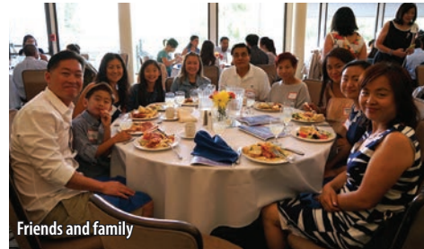
Friends and family