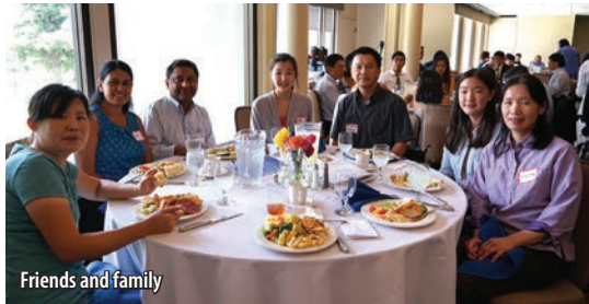
Friends and family