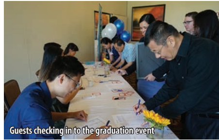
Guests checking in to the graduation event