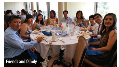
Friends and family