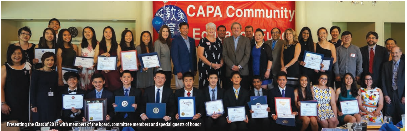
Presenting the Class of 2017 with members of the board, committee members and special guests of honor