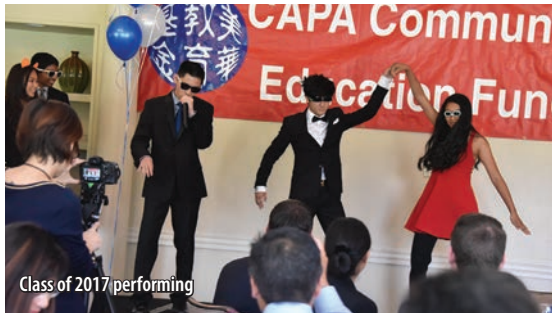
Class of 2017 performing