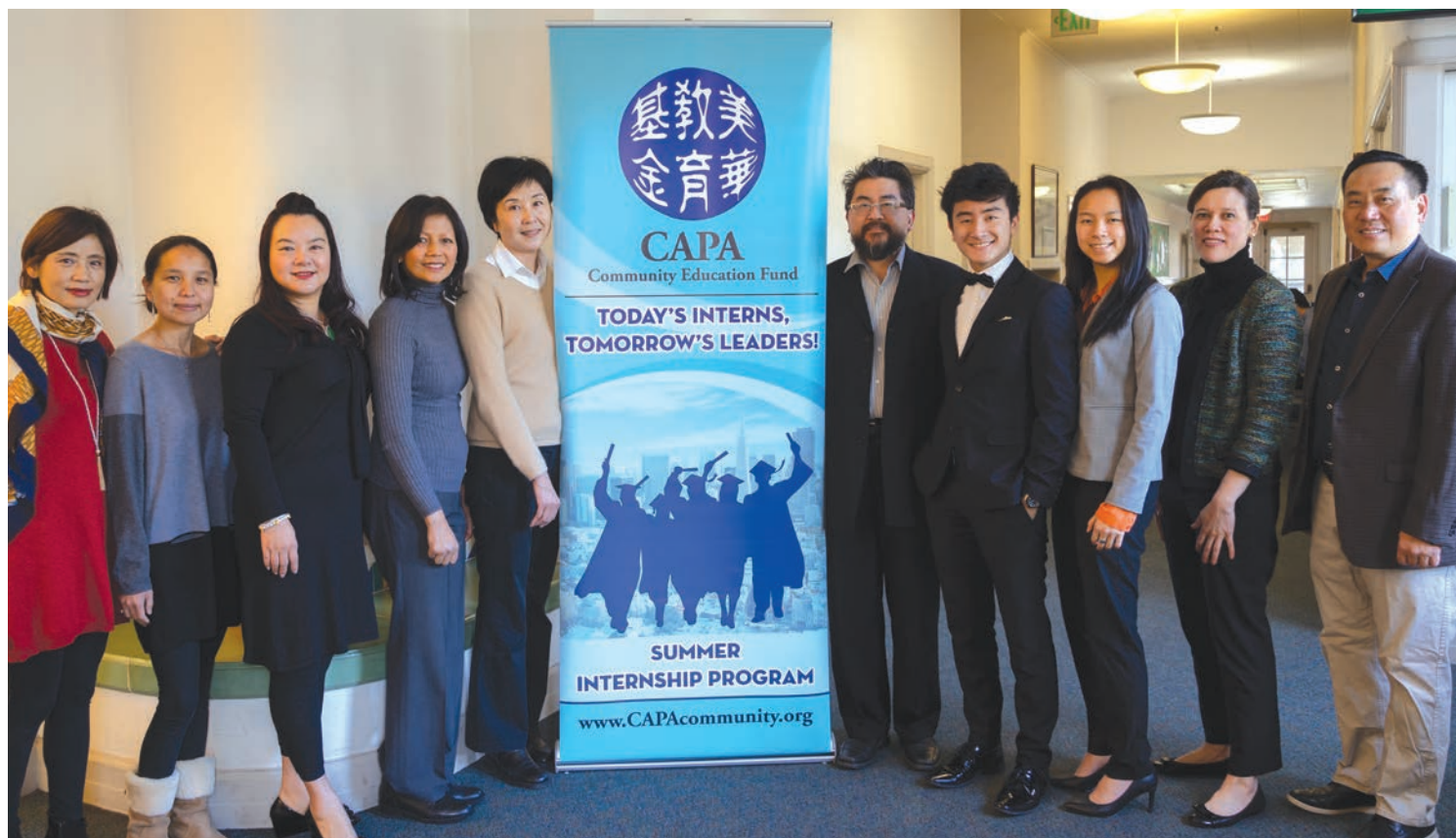
Internship Committee Members and Interviewers