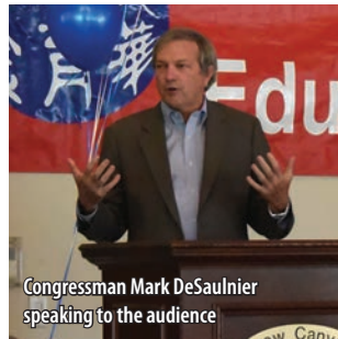
Congressman Mark DeSaulnier speaking to the audience